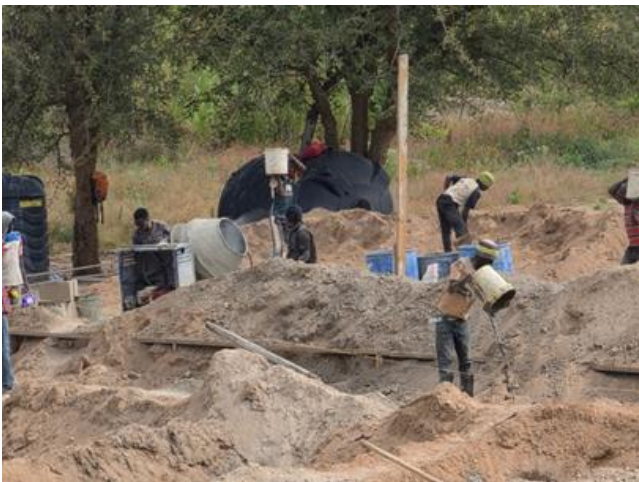
Work on the RCH is underway! All the work is being done manually!