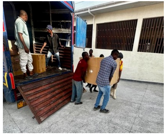
Unloading the purchases from Dar es Salaam