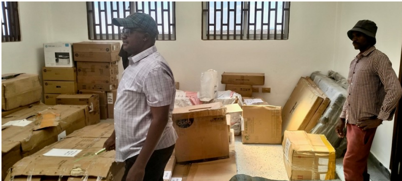
Let the unpacking begin! Looking forward to seeing furnished rooms, one by one. But more items are needed.