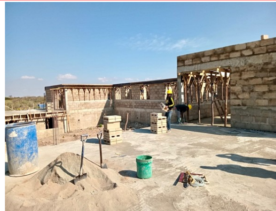
The Outpatient Department walls are going up!

As the walls are going up on the Outpatient Department at Chihoni, the building is taking shape! It is exciting to see the progress month by month. David West, who is onsite with Selemani and his crew, describes the process: Each of the blocks weighs 50 pounds. First they have to be loaded onto the truck, and then at the building site again be carried to the building where masons carefully place them, making sure the channels in the hollow blocks line up so electrical conduit, plumbing, and oxygen systems can be piped through the walls.