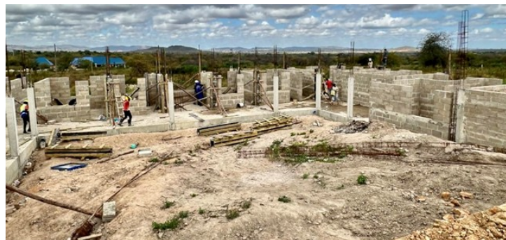
The OPD walls are going up around the central courtyard

While the buildings are going up, detailed planning for medical center operations is taking place. When the OPD opens on September 5, the required equipment, medications, and personnel will be on deck, ready to provide sorely needed medical care.