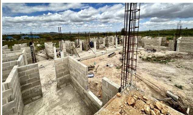
A closer look at the new construction