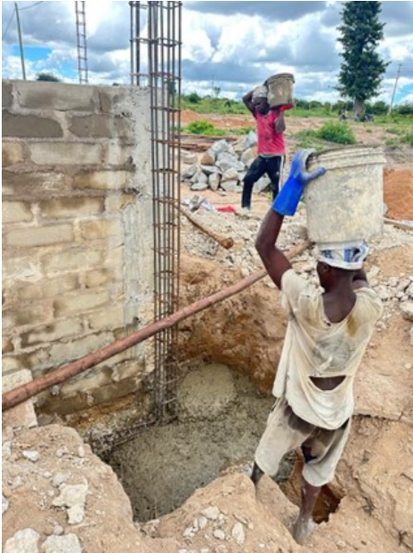
Workers carrying buckets of concrete for the foundation