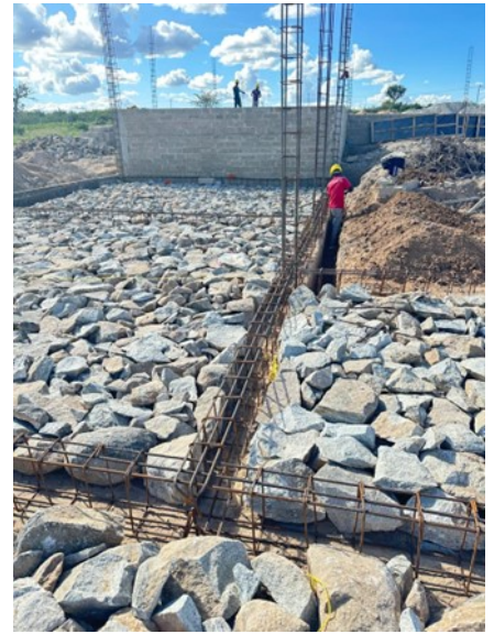
Walls are going up and foundations reinforced

The goal is to see patients by early September, and the project is on track. Phase One is finished, and by the time you read this, Phase Two will be underway. For details, check out ihptz.org and click on IHP Monthly Update. Sele's page and the picture gallery give a great look at what is happening at our Tanzania project, including a drone photo of the OPD foundation.