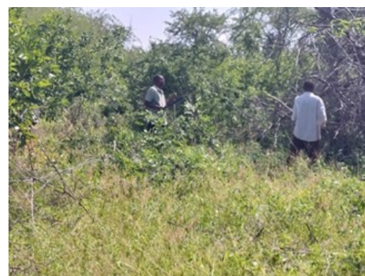
Heavy brush covered the site

Heavy equipment was brought in to clear the building site. Now, everything is at the ready, and as soon as that final building permit is issued, construction will be underway! Mungu akipenda, God willing, this will happen soon!