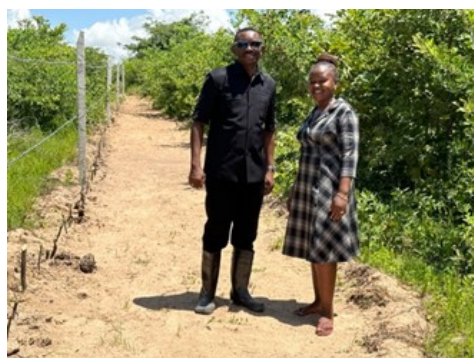
A fence has been installed

Much work has been completed already in preparation for the construction. First, a fence was erected around the perimeter, but the brush was so thick that the ground had to be cleared before the posts could be installed.