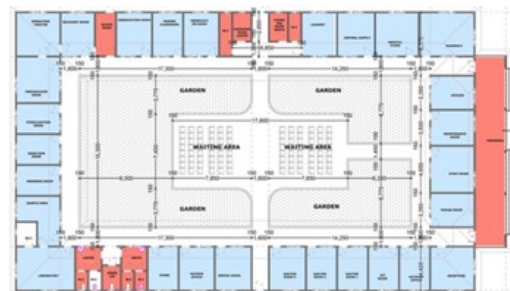
Outpatient Department Floor Plan

The Outpatient Department will be built around a courtyard with a waiting area surrounded by gardens. The surgical suite is located in the top left corner of the drawing. For a larger photo, check out the bulletin board in Fellowship Hall!